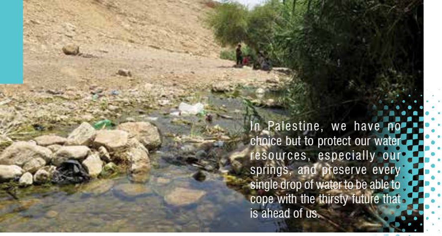
What is left of the spring of Ras 'Ein al 'Auja, near its source. Since repairs are being made to the nearby Israeli water pump, there is more flow than usual.

Israel is violating international law and causing harm to the Palestinian people.