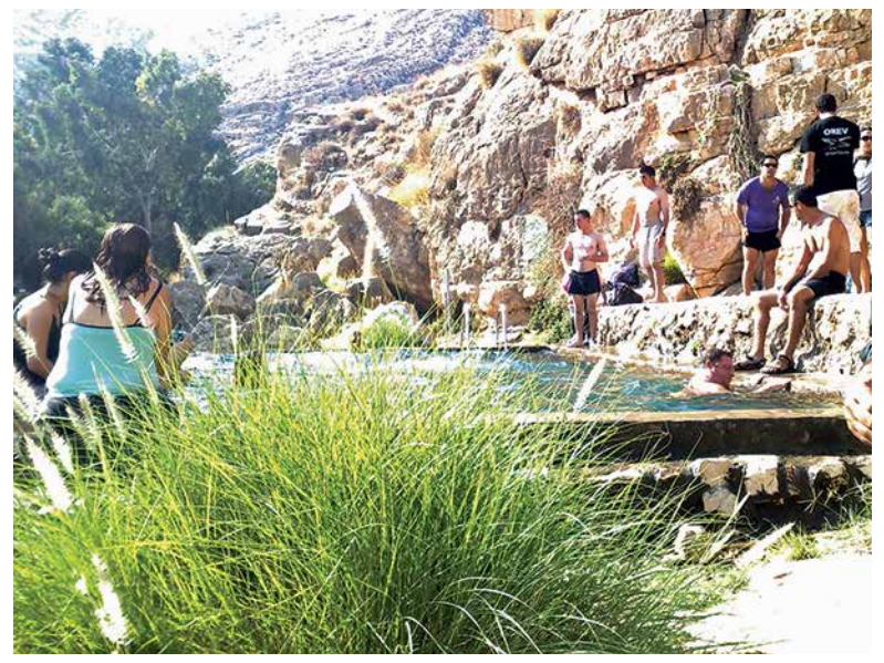
Settlers swimming in Farah Spring.

of groundwater wells, especially Israeli wells that serve settlements in the West Bank, next to or within the springs' effective zones has substantially lowered the discharge of many springs such as Fasayel, Ein Shibly, Bathan, and has even caused some of them to cease flowing seasonally or completely, such as the case of Auja and Far'a springs. This effect, combined with the natural conditions of prolonged drought, have reduced the discharge of many springs by at least 30 to 50 percent of their long-term average