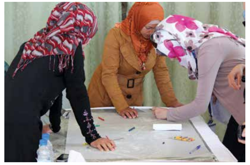
Placemaking Workshop.

In April 2015, the tendering process started in the four localities and attracted wide interest: out of many applicants, one contractor was selected and the implementation phase was finalized by the end of May 2015. The local council association has been in charge of supervising the work, while UN-Habitat's role has been to monitor and support it during the implementation phase.