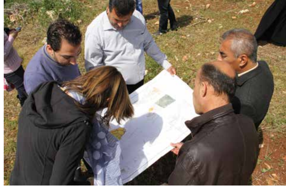
At a site visit in the Abdallah Younis village near Jenin.

Realizing the critical situation of Area C, UN-Habitat salutes Placemaking as a key activity in a program entitled "Planning Support to the Palestinian Communities in Area C" to improve the resilience of the local Palestinian communities. This assistance aims to provide effective planning and coordinated advocacy to Palestinian communities on the one hand, and to enhance Palestinian building capacity on the other hand. Community-design schemes are developed by the Placemaking approach that aims to bridge land-use plans with a better approach to the designing of public places. Thus, UN-Habitat has applied Placemaking to designs in fourteen localities throughout Area C of the West Bank and has implemented them