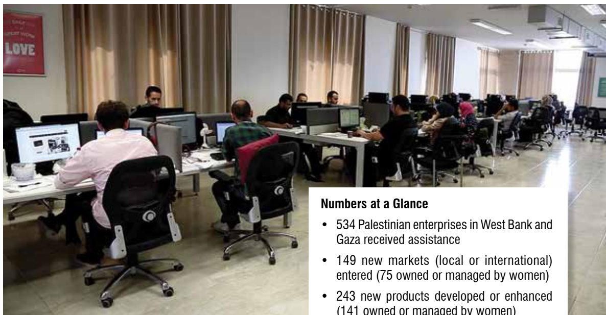
The office of Infinite Tiers Group (ITG), a Palestinian diaspora offshore company located in Nablus.

Palestinians living in the diaspora are no exception: Spread around the globe, they are an asset to and play an important role in the country's economic transformation, contributing either individually or collectively in order to improve local living conditions. Almost every family has at least one member who provides financial assistance, helps provide education, or donates to charity in his or her homeland; diaspora organizations have been active in providing scholarships, medical help, and relief services; and diaspora ICT businesses have engaged by creating employment via offshore branches and companies.