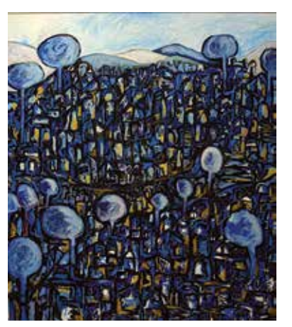
Blue from Gaza, 170x150 cm, acrylic on canvas.