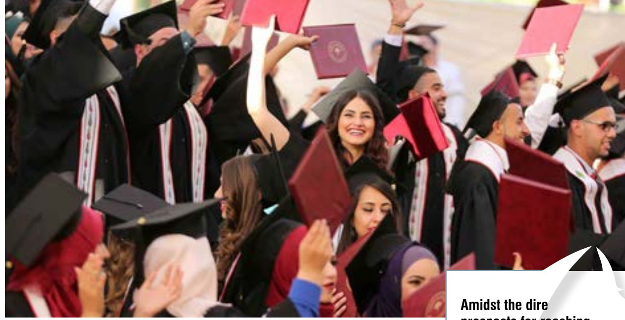
Graduation ceremony at Birzeit University.

processes as a whole. Simultaneously – and as embedded in SDG 8 on Decent Work and Economic Growth – the employability and future employment of young women and girls cannot be enhanced, and their ability to join the labor force cannot be promoted unless we enhance the gender sensitivity and responsiveness of the technicaland vocational education and training programs (TVET) that are provided by different service providers, including the government.