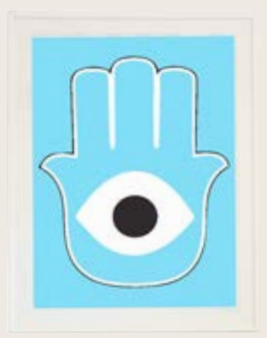
Pigment printing on fine art paper 100 x 70 cm, 2018

Martvrs Road Pigment printing on fine art paper 100 x 70 cm, 2018 Edition 1/1