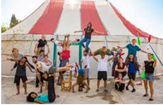
▲ Exchange program between PCS and Circus Zonder Handen in Belgium, in front of PCS circus tent.