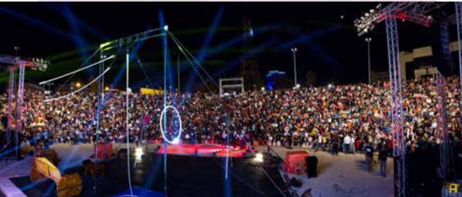
Opening night of the Palestine Circus Festival 2016 - United For Freedom, in Al-Istiqal Park.

Following the success of the 2016 festival, people from all over Palestine approached PCS to request circus shows at events and schools in their communities. In addition to offering regular performances around the country, the Palestinian Circus School decided to organize The Palestine Circus Festival on a biennial basis.