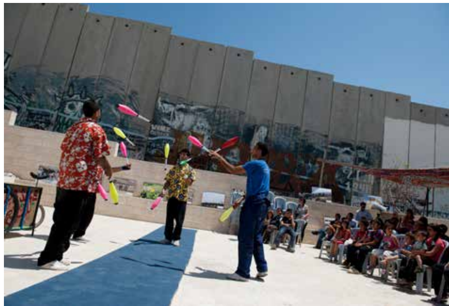
Challenging the barriers to freedom through circus performance.

lives, as individuals and as a nation. However, we continue to believe that a future Palestine is possible, with people who dream of a better life and invest positive energy in society.