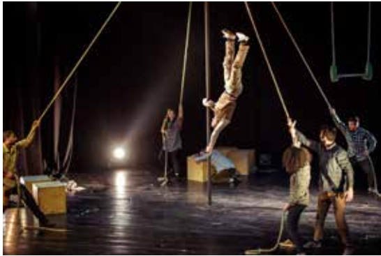
▼ SARAB show by PCS, reflects the repetition of history with regard to refugees.

disabilities, and refugees) because we are convinced that we all have the right to access opportunities for learning, for improving our lives, and for experiencing joy. Each of us matters, and together we can make our society better. This is where we put our energy in order to create an inclusive society. Art is never made just for the sake of art inside the walls of our circus school. Everything leads to improving our society.