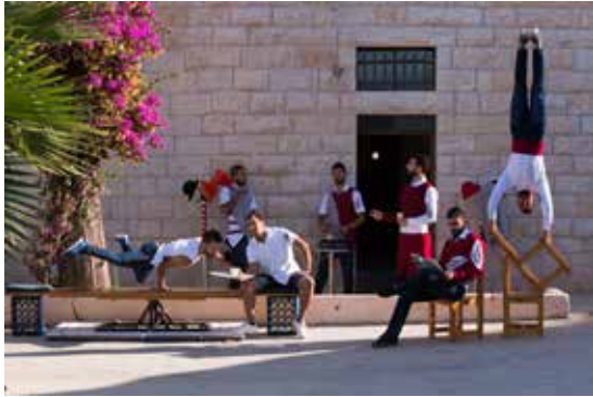
◀ Coffee In Town , a family show by PCS.