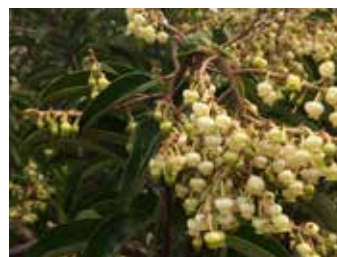
Arbutus andrachne Eastern Strawberry Tree قنيق، القطلب