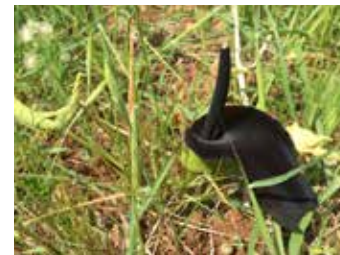
Arum palaestinum Palestine Arum اللوب الفلسطيني