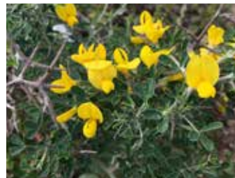
Calicotome villosa Spiny Broom القندول، القنديل