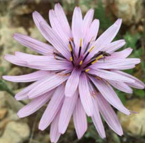
Scorzonera papposa Oriental Viper's Grass مخدة العروس، ربحلة

As I do every month, I implore people to think of nature and our responsibility to care for it. We have done so much harm already. And that harm is also done to our own bodies. For if the environment is not healthy – rich in biodiversity and free from pollution and destruction – then we surely cannot continue to live in such an environment!