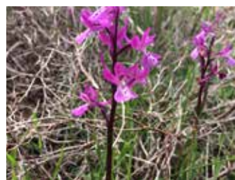
Orchis Anatolica Anatolian Orchid خصيتين الكلب، سحلب، اوركيد الاناضول