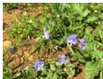
Veronica syriaca Syrian Speedwell زهرة الحواتي السورية