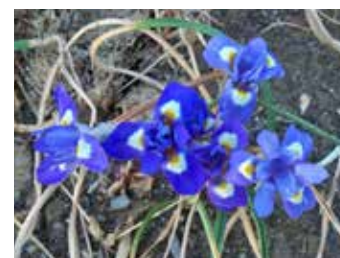
Moraea sisyrinchium Afternoon Iris السوسن العادي