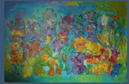
Nus Nsais mixed media on canvas 120 x 70 cm

Nus Nsais, through all its means, is a symbol of Palestinian existence that rejects its crushed reality and suppression, and overcomes the experience of displacement and demolition. Reem. however. constructs a tale that will never be subject to destruction but rather thoroughly enforces the sense of existence, power, and eternity.